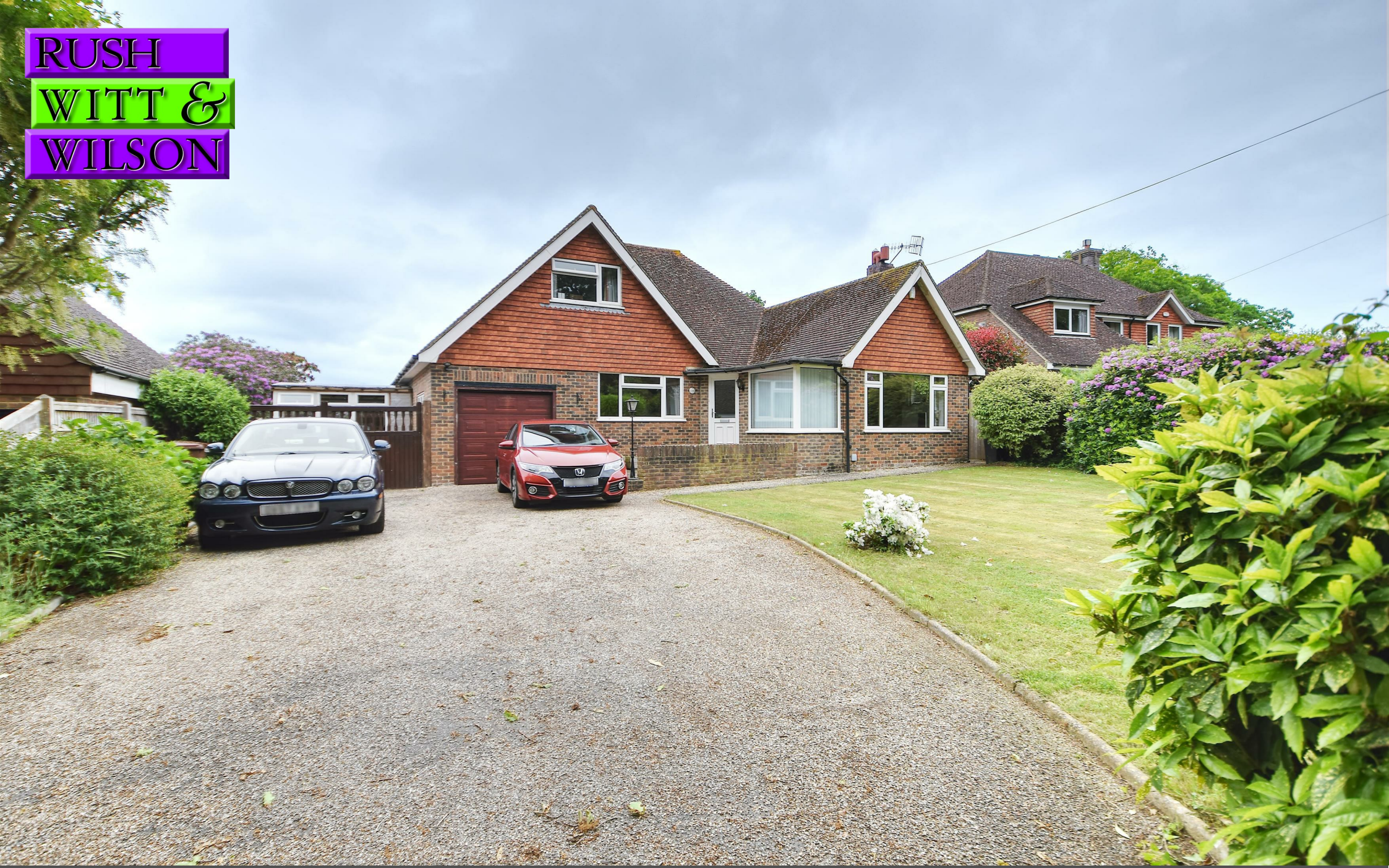
'Normandy' 24 Ellerslie Lane, Bexhill-On-Sea, East Sussex TN39 4LJ £725,000